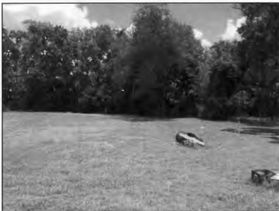
Looking East at Subject Property