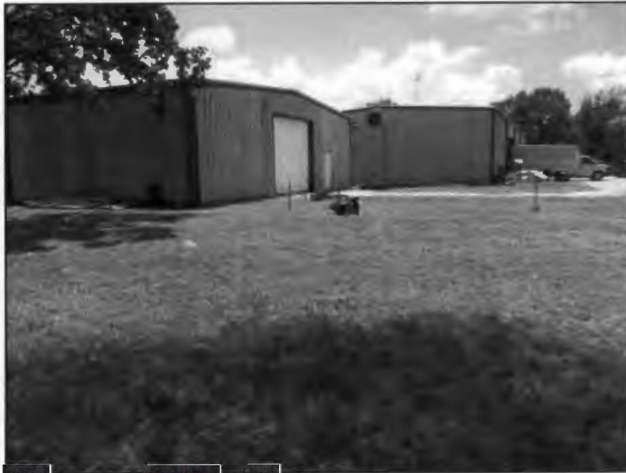
Looking West at Subject Property