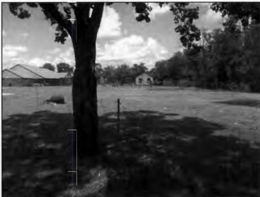
Looking North at Subject Property