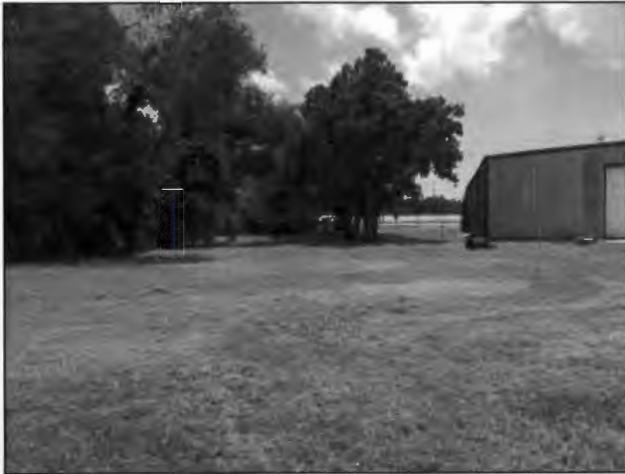
Looking South at Subject Property